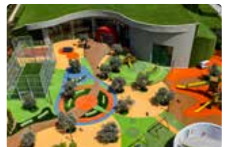
Bamboo Kids World