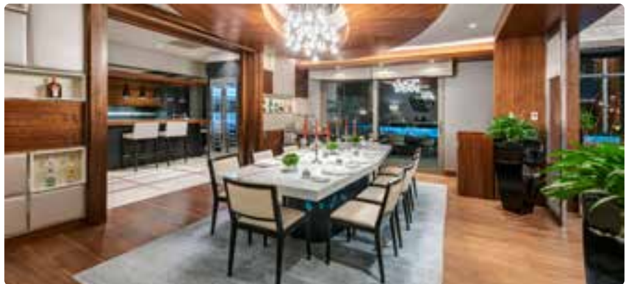
Kitchen & Dining Area