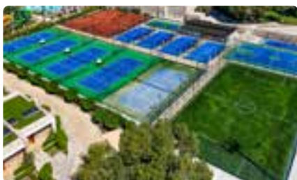
Tennis, Padel, Pickleball, Basketball courts