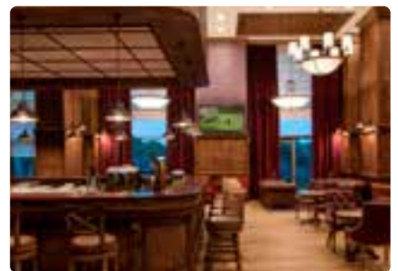
The Shamrock Bar