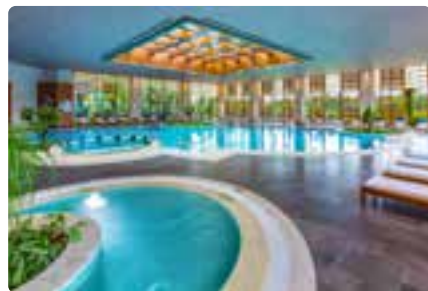
Spa Indoor Pool