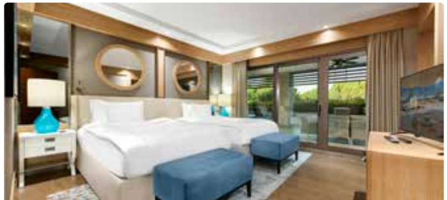
2 nd Bedroom