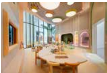
Bamboo Kids World

Opening days and hours may vary depending on the number of guests.