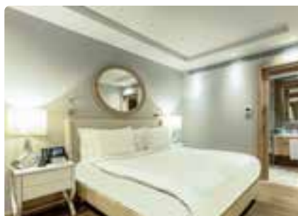
Bedroom (King Bed)