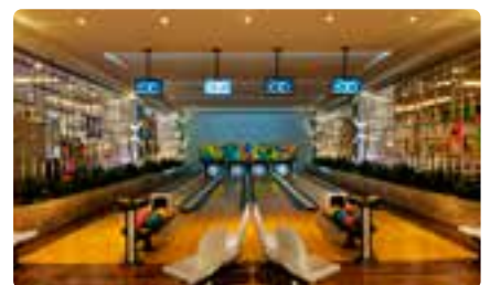
Knock Knock Game Center

Outdoor evening stage shows and parties run between May 1 and October 31. The days or hours of the entertainment program may change due to adverse weather conditions, technical reasons and guest requests.