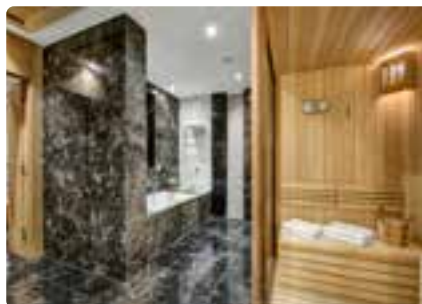
Bathroom & Sauna