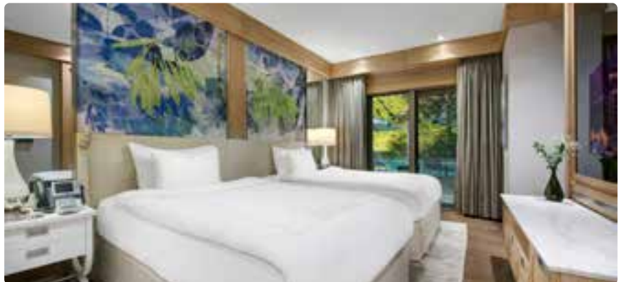
3 rd Bedroom