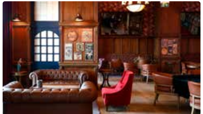
The Shamrock Bar