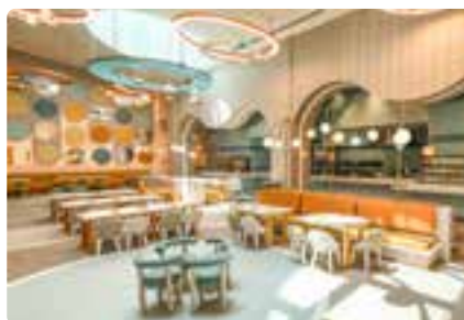
Bamboo Kids World