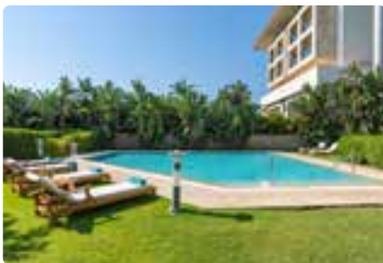
Spa Outdoor Pool