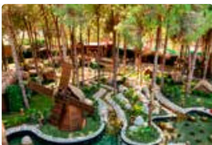
Ali Baba's Farm