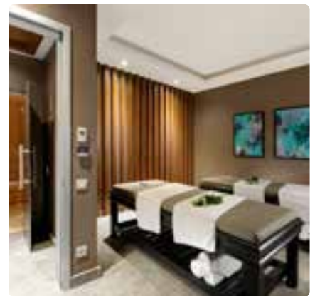
Massage Room & Sauna