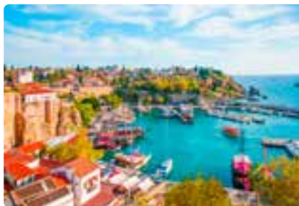
Old Town (Kaleiçi)