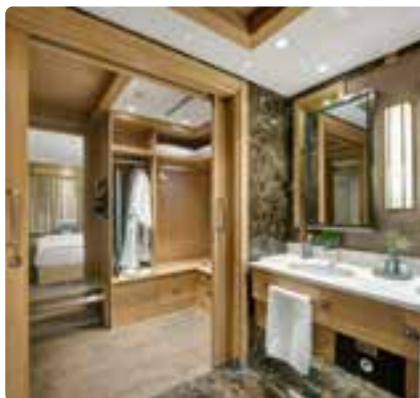
Dressing Room & Bathroom