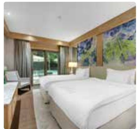
2 nd Bedroom