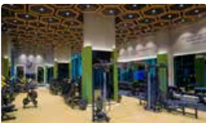
*Extra charges apply.

Yoga, Pilates, Boxing, Kickboxing, Weight Training, Functional Training, HIIT, LIIT, Cardio Training, Sport Specific Training (golf, tennis, football), Stretching, Kinesis Workouts