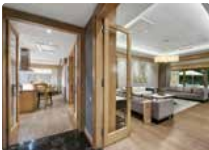
Living Room & Separate Kitchen

*Please ask your assistant for pool heating and cost information.