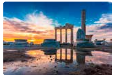
Side Ancient City